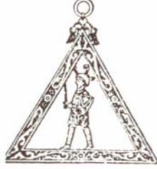
Captain of Host