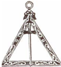
Master of the 1 st Veil