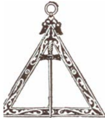
Royal Arch Captain