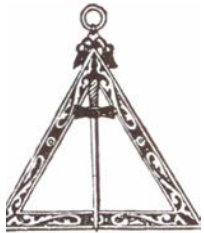
Master of the 2 nd Veil